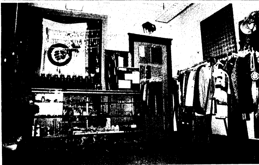
On the inside at Earth Works

It's wierd enough to spray this stuff all over your pots and pans, but whatever you do, don't inhale it! It's beginning to look like too often the only trip you'll get out of it is a trip to the morgue.